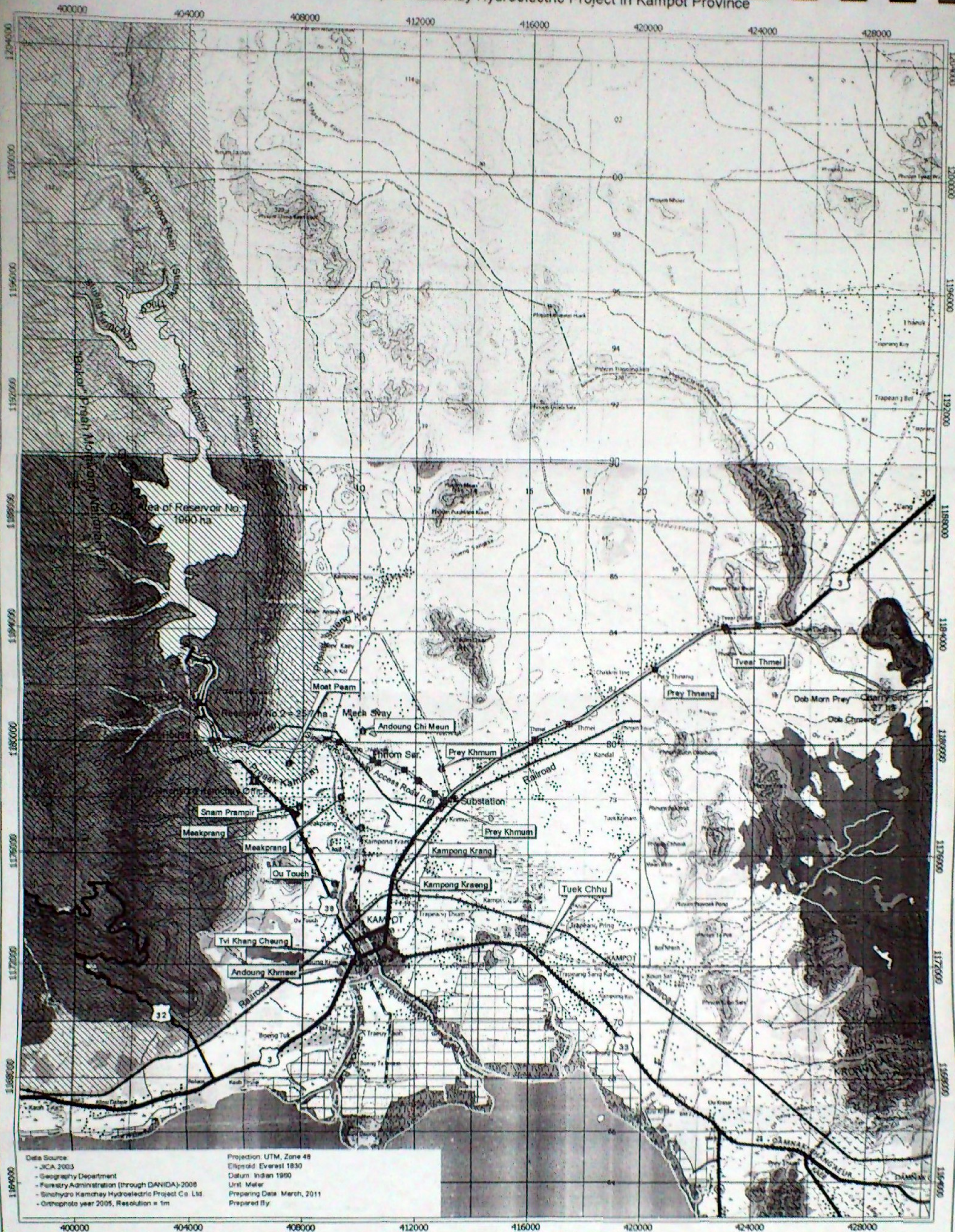
Map No.1 Location Map of Kamchay Hydroelectric Project in Kampot Province