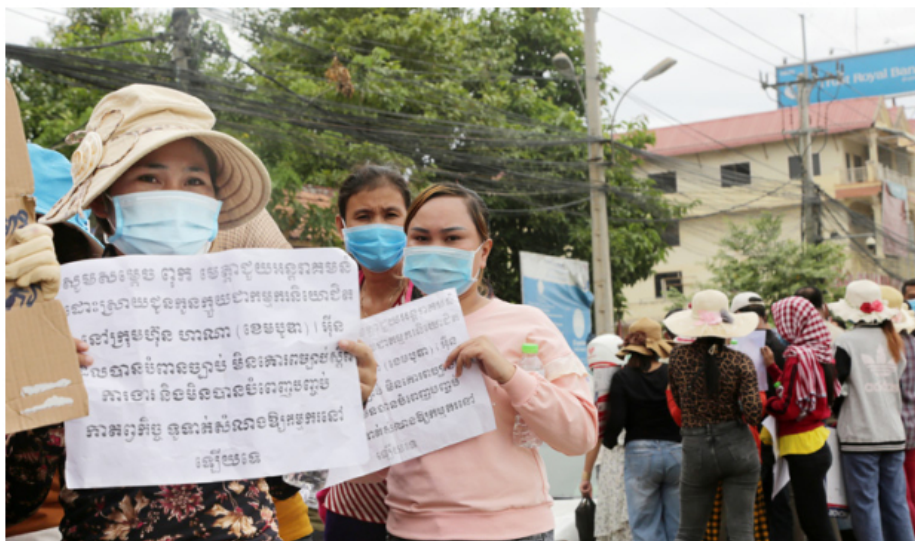
Protesters are prevented from submitting a petition to Prime Minister Hun Sen's residence in Phnom Penh a second time.

Click here to get Khmer Times Breaking News direct into your Telegram