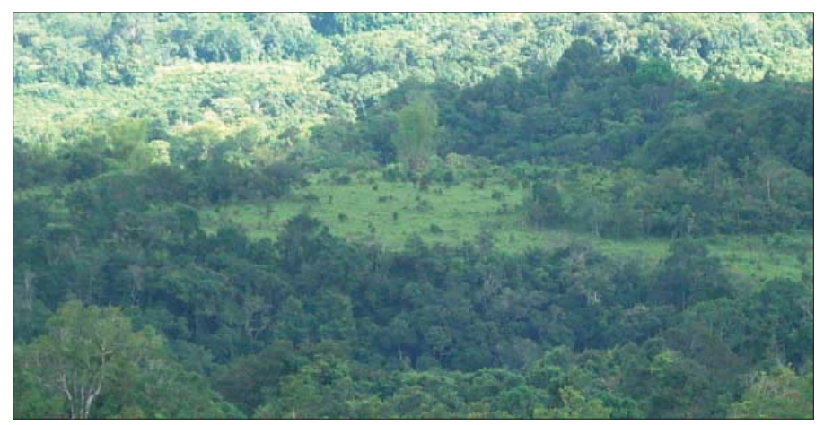
Pu-Trou village cemetery seen from the mountain.

The Pu-Trou village cemetery is approximately 2,000 meters away from the village. The cemetery is not a forbidden area for villagers. However they believe that those who enter the cemetery should not perform any acts of disrespect to the dead, such as shouting or destroying the surrounding environment. If they fail to follow such rules, it is believed that ghosts will cause them to fall ill.