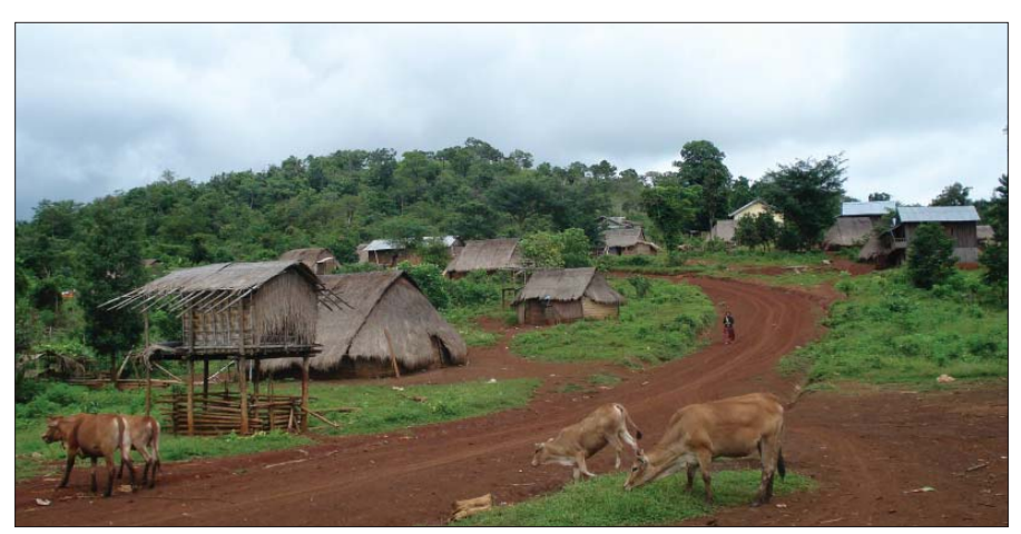
Scene from Pu-Trou village.

house. That night he dreamt that the rock advised him to sacrifice a buffalo and eat all its meat if he and his children wanted to prosper. He then sacrificed a buffalo as told, but could not eat all the meat; 30 pieces were left. Thus, the rock proclaimed: 'only you shall prosper, your children will not'. The next morning, he told all the villagers about the dream. The villagers believed that the rock was sacred and sacrificed a buffalo to pray to the spirits. They attributed the name of the rock to the name of the old man and called the stream Elder Trou rock stream which was later shortened to O'Trou stream. And subsequently the name of the village became Pu-Trou.