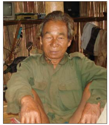
A Purahn Ban in Pu-Trou village.