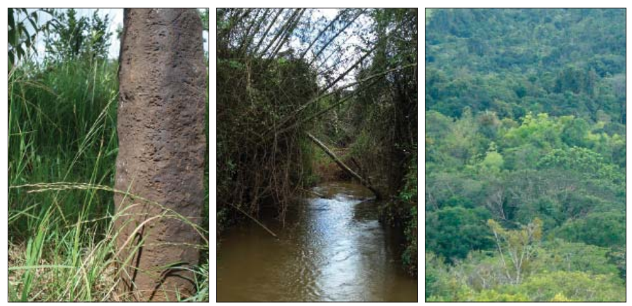
Sacred places or worship areas.

There used to be a lot of sacred forests but most of them have disappeared due to deforestation. What remains for the villagers is a small altar of the village spirits at the end of the village boundary where people perform sacrifices to praise the spirits and to hold the New Year celebration.