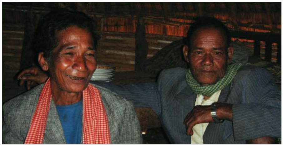
Elders in Pu-Trou village.

A Purahn Ban is not selected based on any particular criteria. A person becomes a Purahn Ban if they are considered to be in good standing within the community and are knowledgeable in traditional beliefs and capable of solving conflicts. The majority of Purahn Ban inherited their title; however, inheritance is not the main criteria for selecting a Purahn Ban .