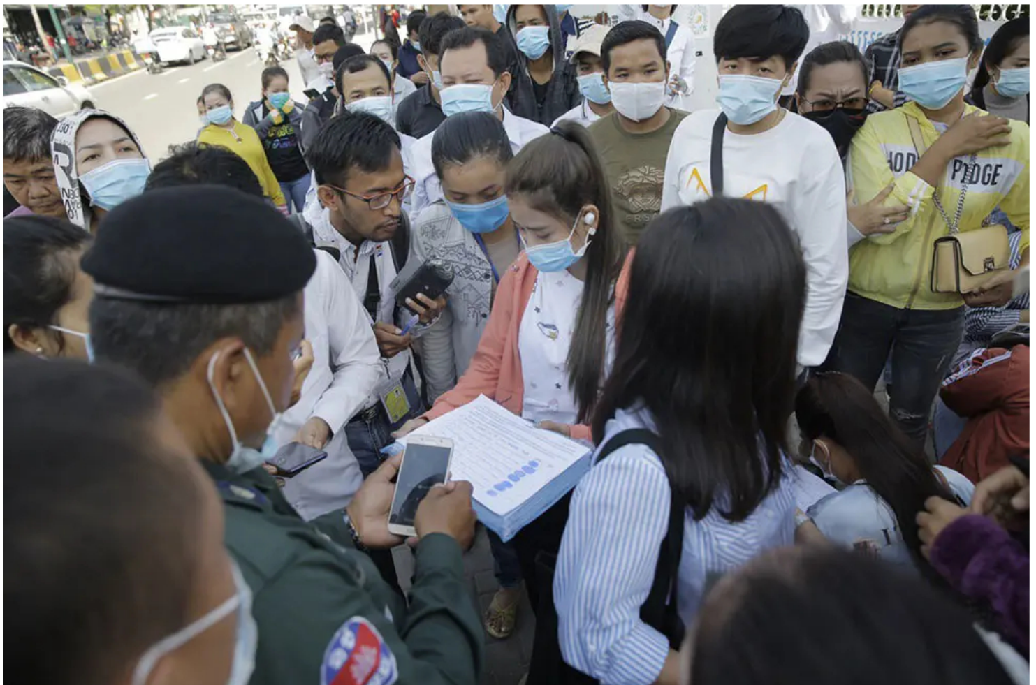
Employees of NagaWorld casino present their petition outside the Labor Ministry on June 16 appealing for stimulus payments as entertainment facilities remain closed in Cambodia amid the Covid-19 pandemic. Panha Chhorpoan