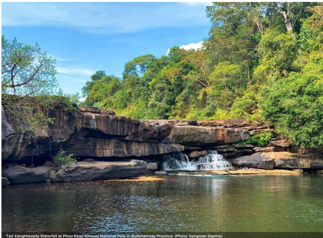
Tad Xangthevada Waterfall at Phou Khao Khouay National Park in Bolikhamxay Province.