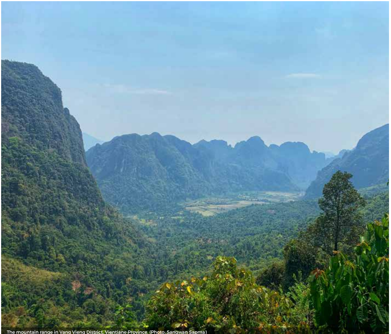
The mountain range in Vang Vieng District, Vientiane Province.

In the planning guidelines, processes and templates under the Forestry Law, the category of public utility land should be expressly included.