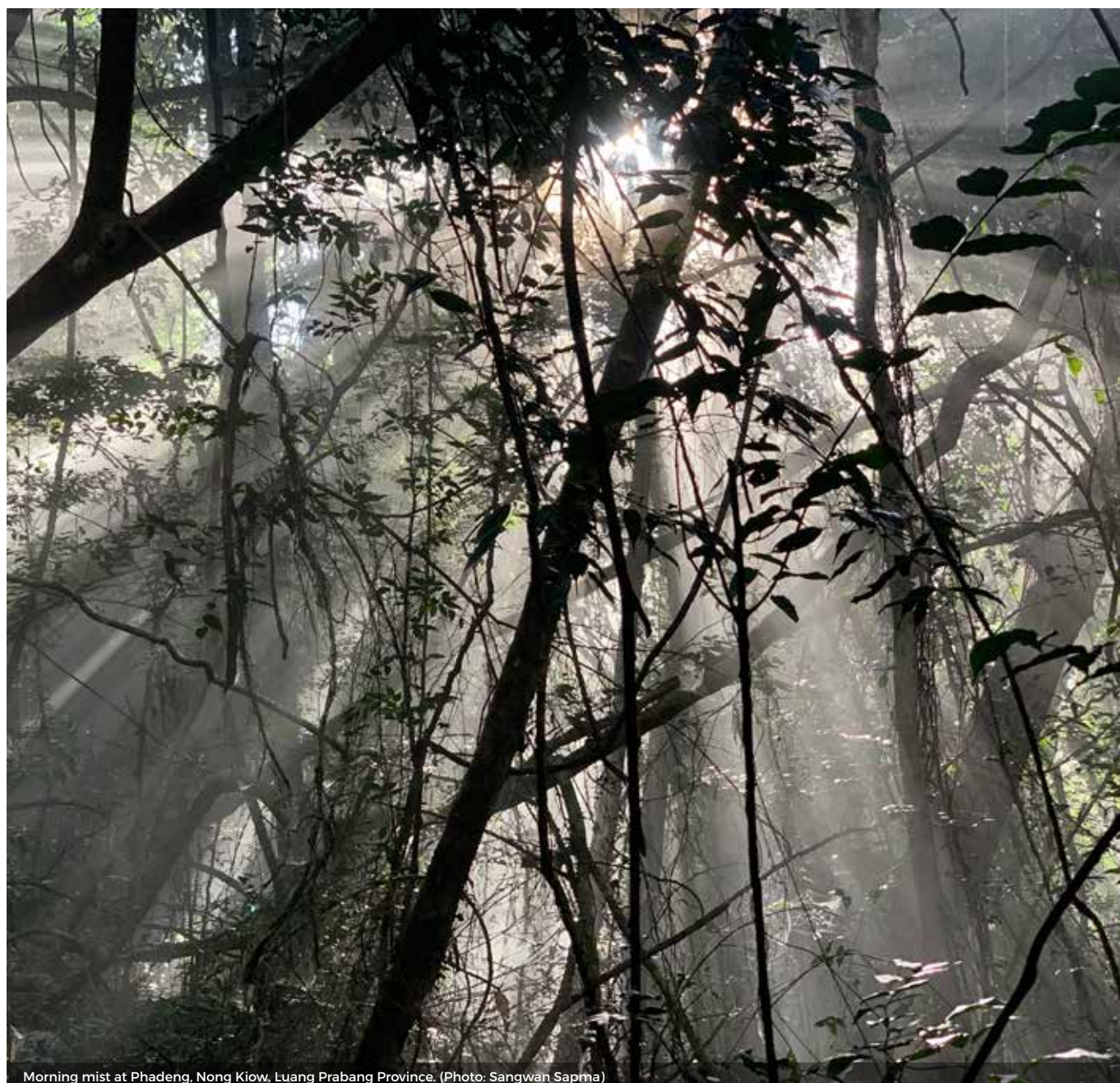
Morning mist at Phadeng, Nong Kiow, Luang Prabang Province.

Law that much detail still remains to be clarified, so it may be necessary for MONRE to produce at least one new prime ministerial implementing decree. It is certain that the various regulations, such as those dealing with land titling, will need updating and other new regulations, such as those on condominiums, will be required. Thus, there is potential for civil society and others to provide input to the drafting of those documents in such a way as to enhance the current provisions of the Law, fill the many gaps and address the small number of overlaps. Similarly, there is potential for the implementing legislation under the Forestry Law 2019 to be enhanced through input to issues such as those covered in this report.