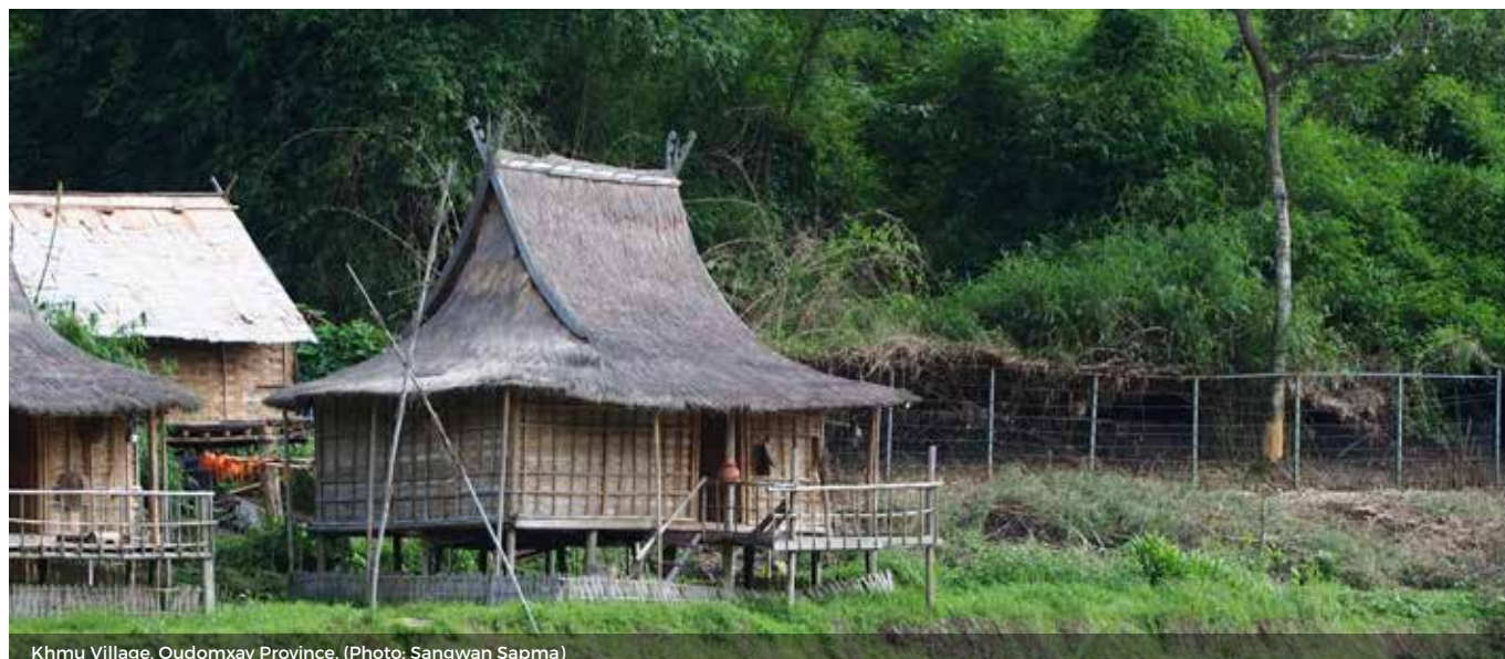
Khmu Village, Oudomxay Province.