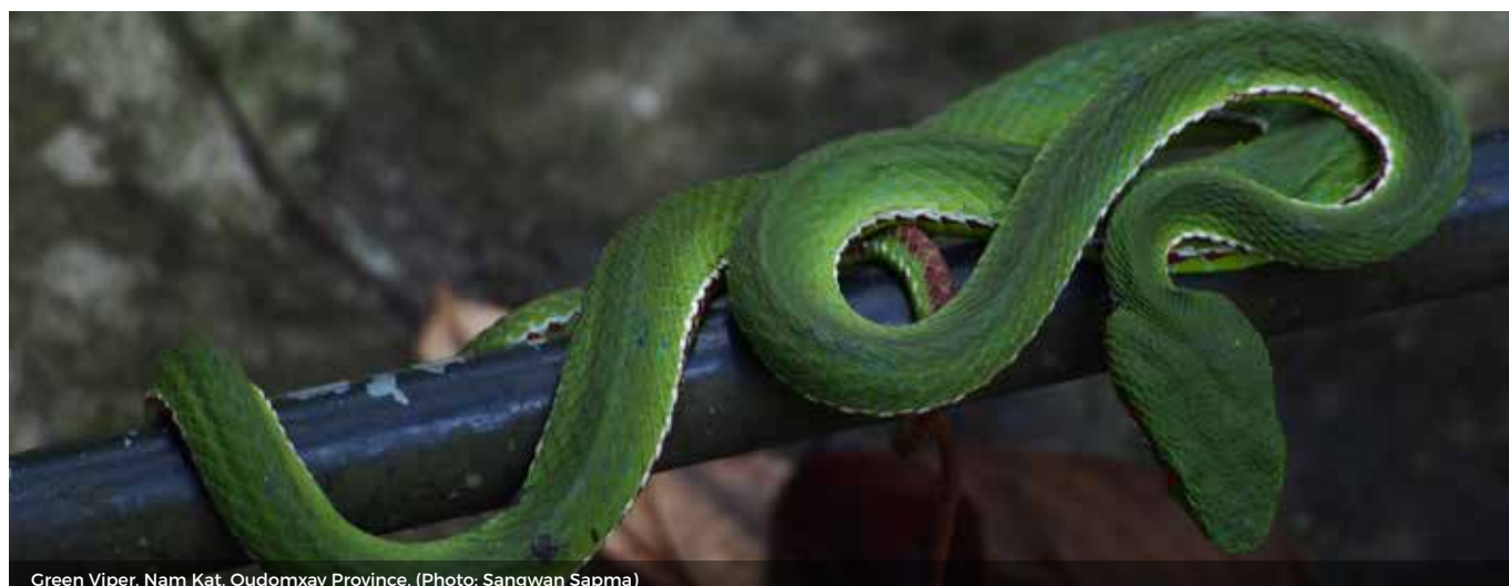
Green Viper, Nam Kat, Oudomxay Province.

In Part 3 of the 2003 Land Law, Articles 73 to 76, which deal with the land of Lao citizens who fled during the revolution or fought for liberation, and also land given to collectives , no longer appear. However, such abandonment or assignment is now the basis for a right to be terminated under Article 147 of the 2019 Law.