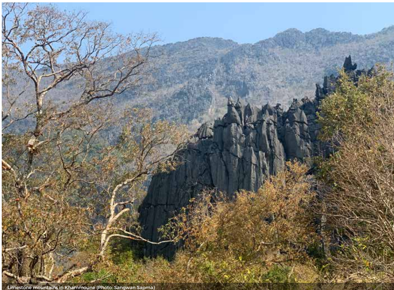
Limestone mountains in Khammoune