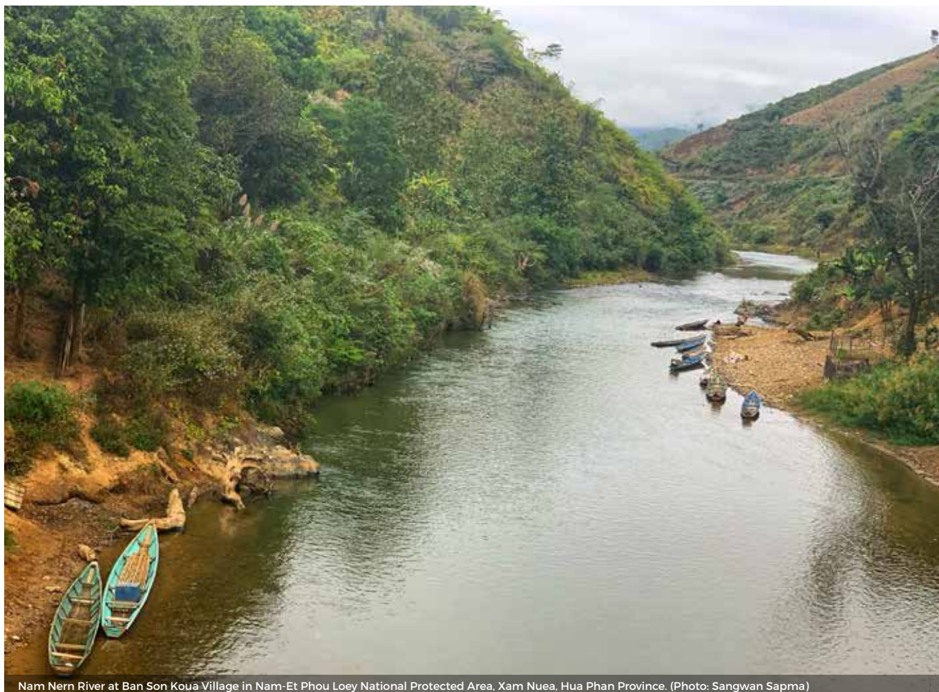
Nam Nern River at Ban Son Koua Village in Nam-Et Phou Loey National Protected Area, Xam Nuea, Hua Phan Province.