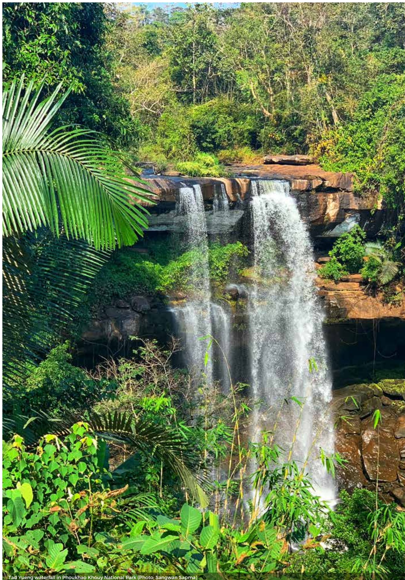
Tad Yueng waterfall in Phoukhao Khouy National Park