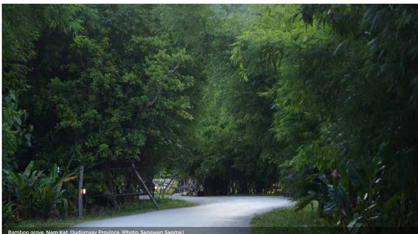
Bamboo grove, Nam Kat, Oudomxay Province.