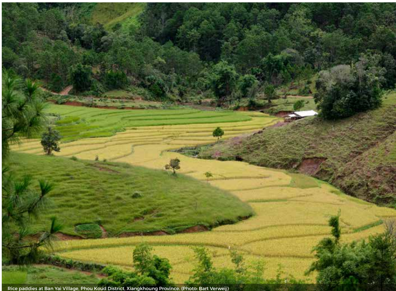
Rice paddies at Ban Yai Village, Phou Koud District, Xiangkhoun Province.