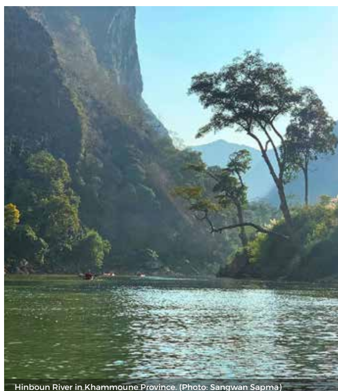
Hinboun River in Khammoune Province.