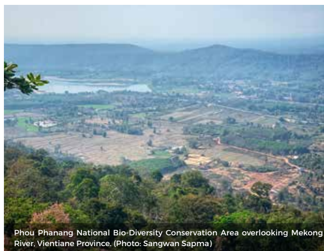
Phou Phanang National Bio-Diversity Conservation Area overlooking Mekong River, Vientiane Province.

The implementing decree or regulation should clarify the extent to which the provisions of the Land Law on custom apply to forest and forest land, if at all. The question of issuing a title for agriculture land within Controlled Use Zones, and whether this is a forest use right or land use right, should also be clarified.