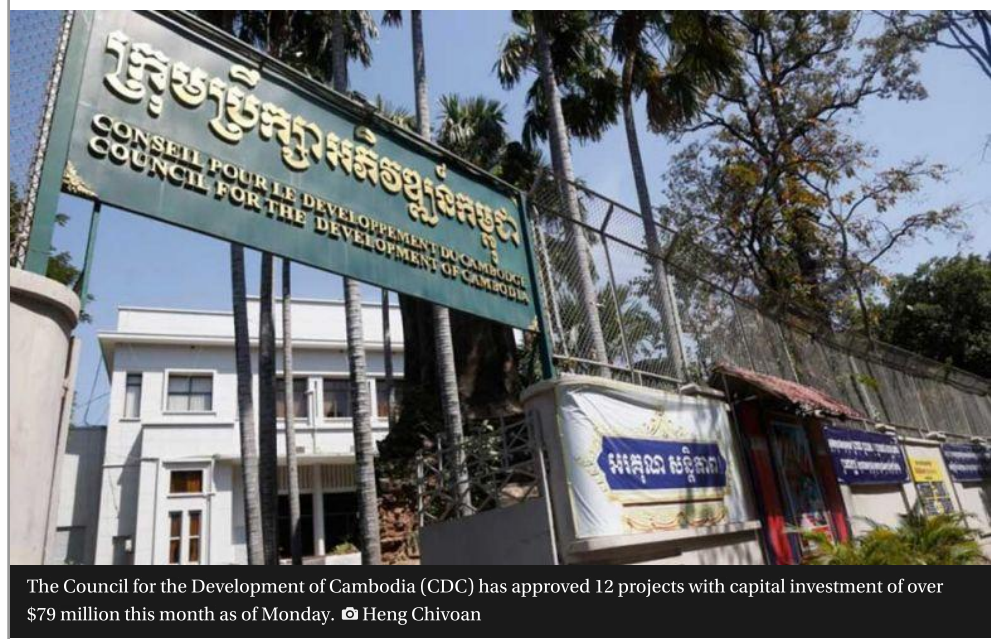
The Council for the Development of Cambodia (CDC) has approved 12 projects with capital investment of over $79 million this month as of Monday.